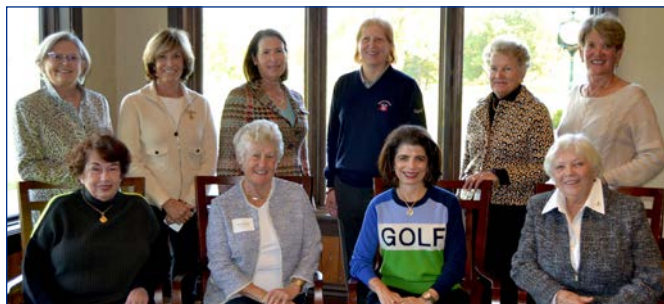
Former WMGA Presidents