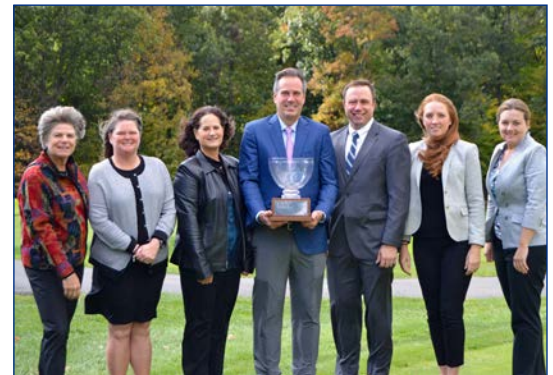
Metropolitan PGA staff

Make the WMGA Foundation a part of your year-end giving.