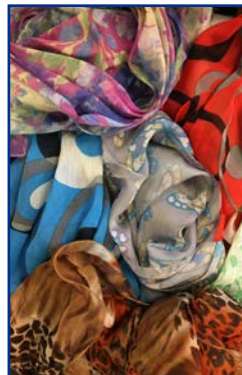
Grace Jin gift scarves