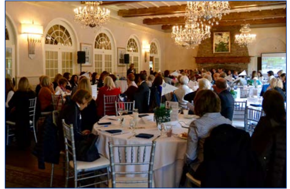
Annual Meeting room